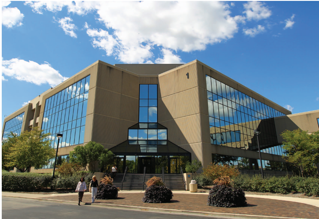
Ashland, a global specialty chemical company with business in more than 100 countries has expanded its product offerings to automotive, water treatment, pharmaceutical, construction, and more.